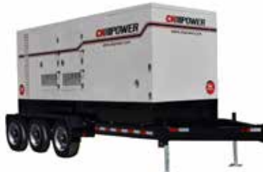
CK Power Mobile Generators (12-1250 kW)