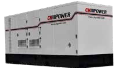
CK Power Stationary Generators (12-1250 kW)