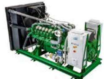
2G by CK Power Demand Response Generators (620-1000 kW)