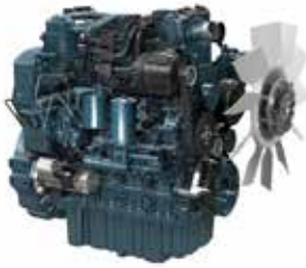
Kubota Engines (13.3-215 hp)