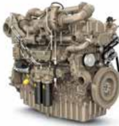
John Deere Engines (74-908 hp)