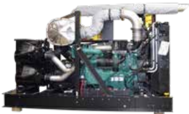
CK Power Skid Mounted Generators (12-625 kW)