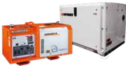
Portable Generators • Kubota GL Series (7-14 kW) • CK Power Portable Generators (7 kW)