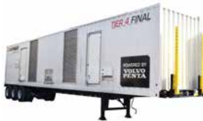
CK Power Containerized Generators (500-1250 kW)