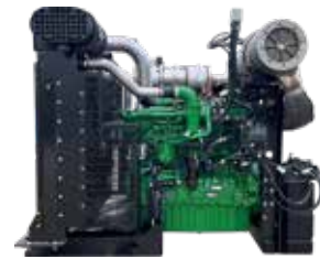
Custom Power Units (5-908 hp)